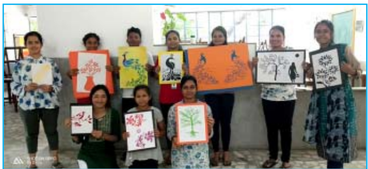
TEACHER'S WORKSHOP AT MIRAMBIKA, 6 OCTOBER 2022