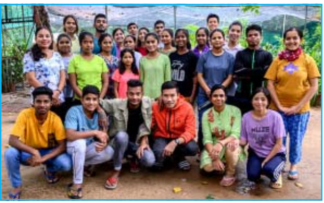
ORGANIC FARMING WORKSHOP, 8 OCTOBER 2022